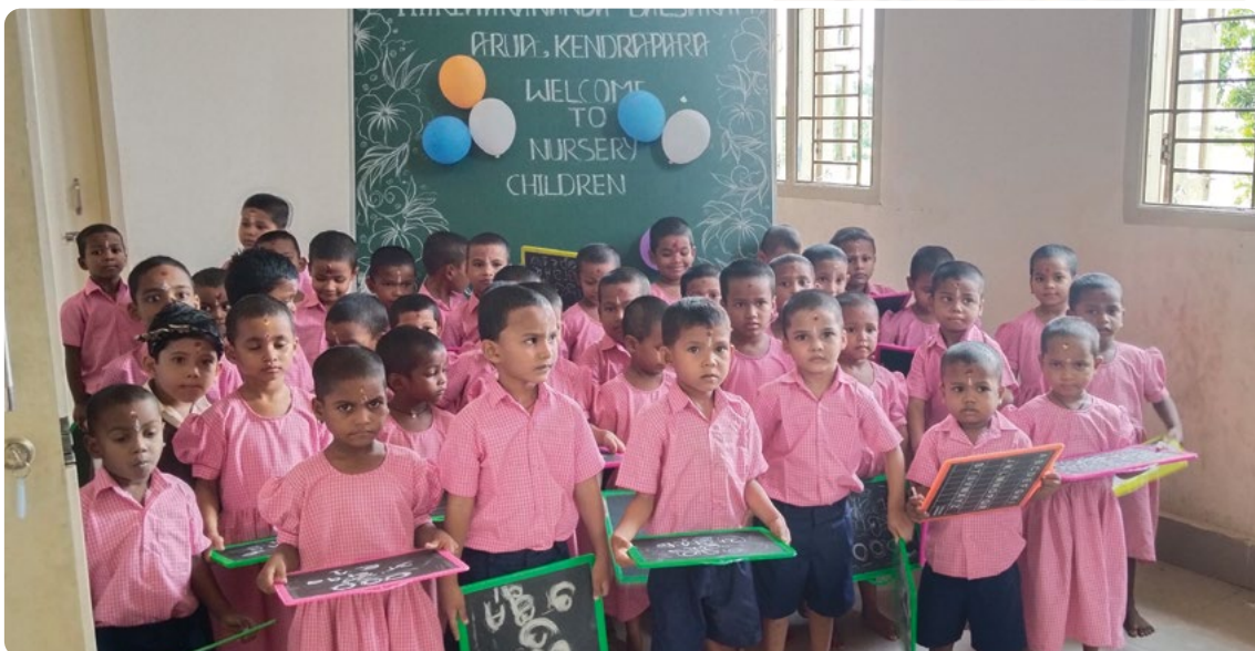
They are already part of the loving Balashram family.