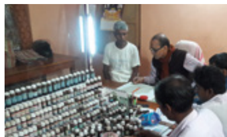
HCHC Bhisindipur 2004