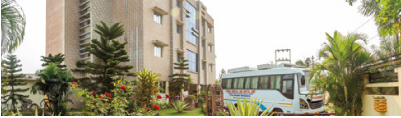
HCHC Jagatpur 2014 (day clinic)

services. In addition to general medical treatments, specialist skin treatments are offered at regular intervals, and dental and physiotherapy services are offered twice a month. Preventive services are also being developed at HCHC Balighai; currently yoga is being offered.