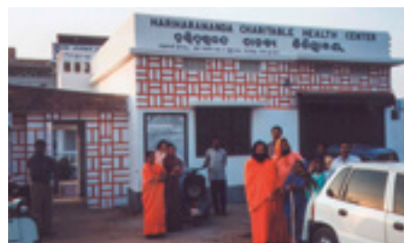
HCHC Jagatpur 1999