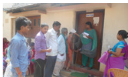
VHP Arua 2010