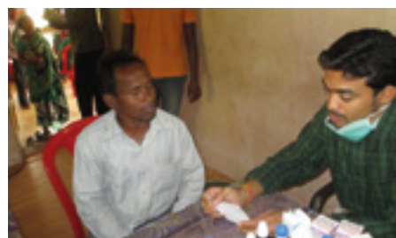
VHP Athagarh 2012